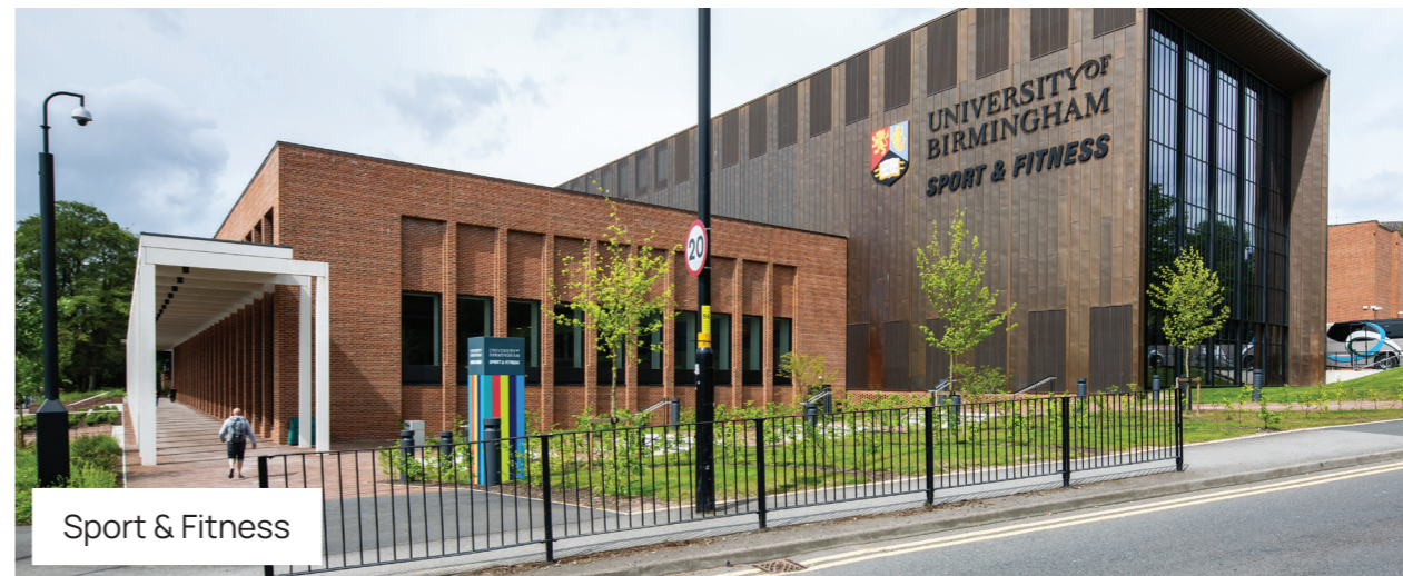
Sport & Fitness