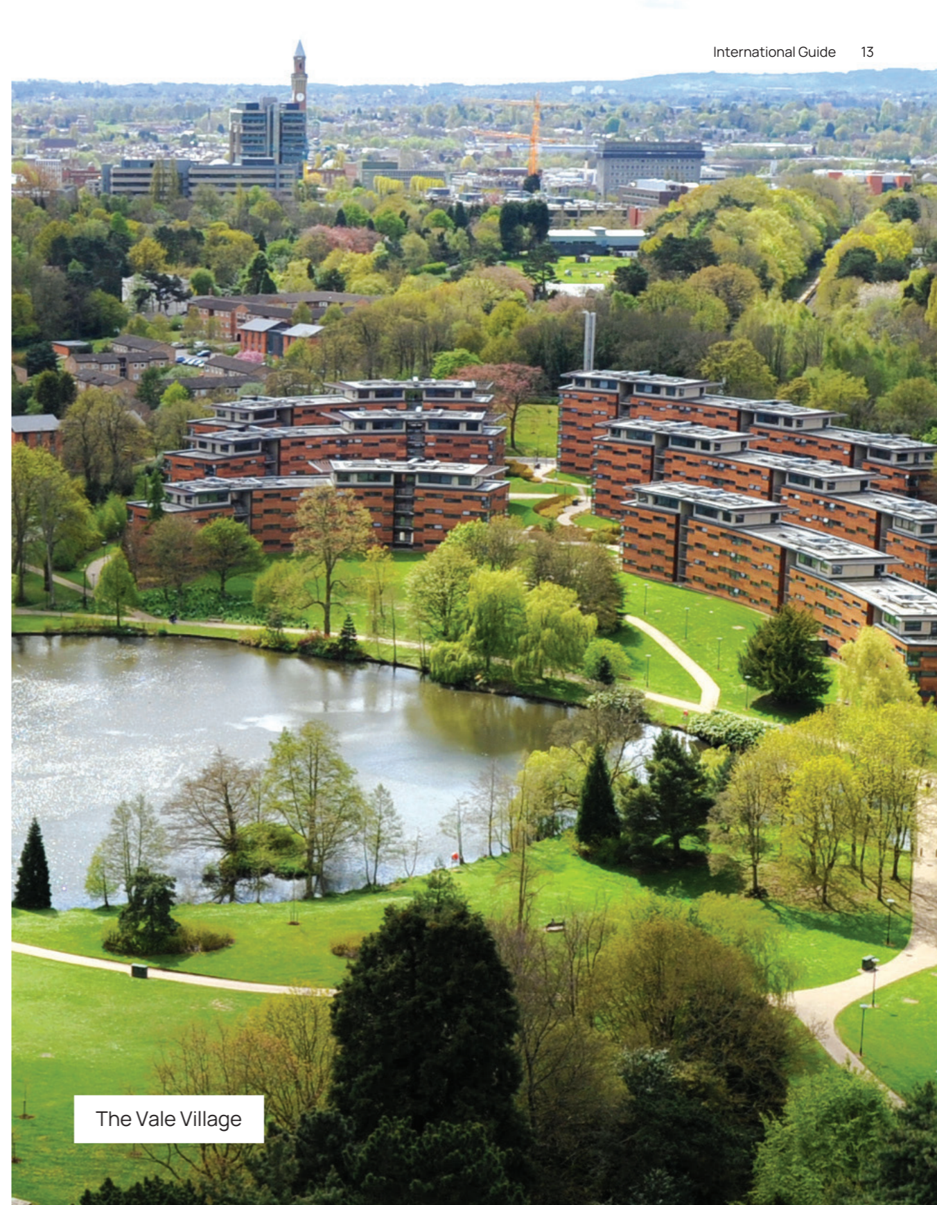
The Vale Village

You will also need to consider the cost of any visa applications as well as budgeting for the immigration health surcharge. Scan the QR code for more information about costs: birmingham.ac.uk/studentvisas