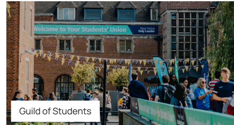
Guild of Students